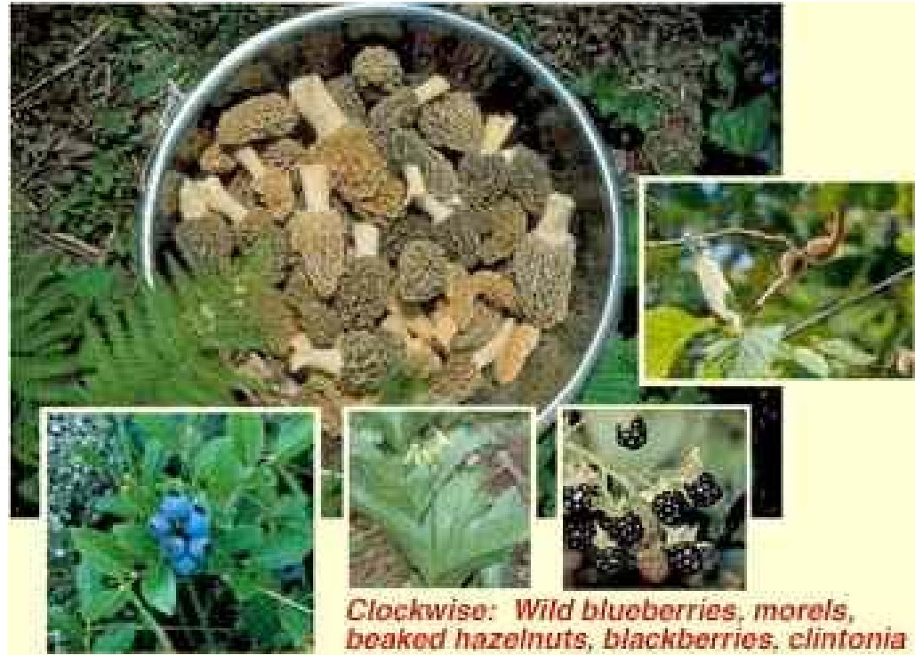
Clockwise: Wild blueberries, morels, beaked hazelnuts, blackberries, clintonia