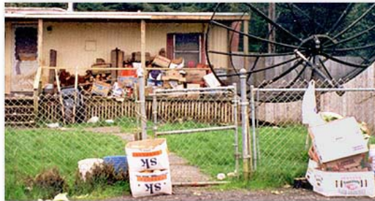
Clutter attracts rodents.